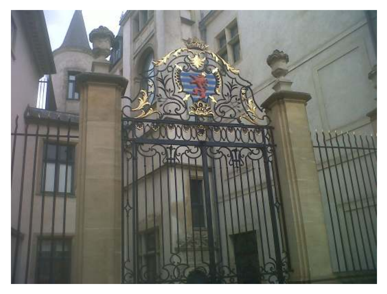
The gates of the residency of the Grand Duke of Luxembourg. The "Red Lion" features on the alternate flag for Luxembourg and is often seen at football matches.